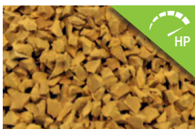
Honey Gold 5312A