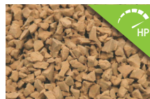
Sandstone Beige 5303A