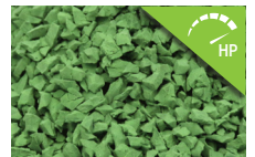
Lime Green 5317A