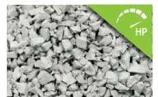
Ash Grey 5305A