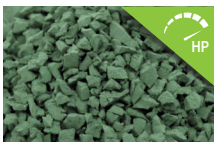
Shamrock Green 5300A