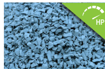
Sky Blue 5315A