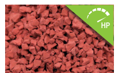
Cherry Red 5311A