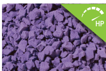
Lilac Purple 5320A