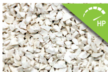
Coconut Cream 5324A