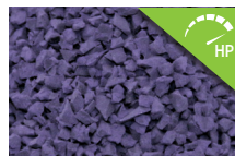
Plum Purple 5309A