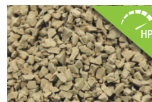
Pampas Ivory 5322A