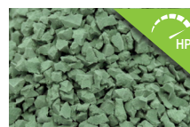
Ivy Green 5310A