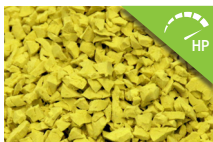
Canary Yellow 5314A