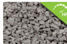
Pewter Grey 5304A