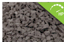
Charcoal Grey 5321A