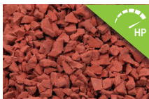
Inferno Red 5302A