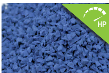
Sapphire Blue 5318A