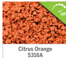
Citrus Orange 5316A