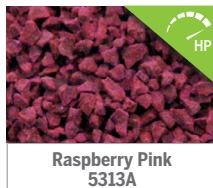
Raspberry Pink 5313A