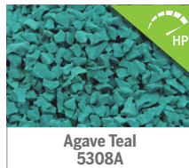
Agave Teal 5308A