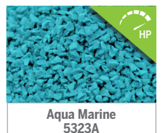
Aqua Marine 5323A