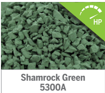
Shamrock Green 5300A