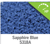
Sapphire Blue 5318A