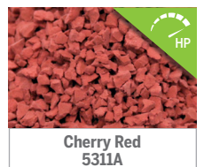
Cherry Red 5311A