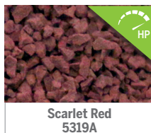
Scarlet Red 5319A