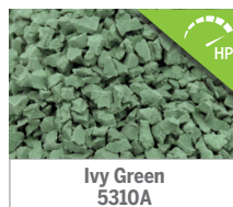
Ivy Green 5310A