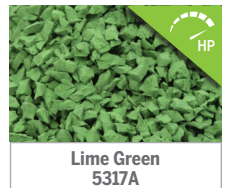
Lime Green 5317A