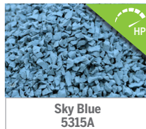
Sky Blue 5315A