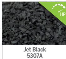
Jet Black 5307A