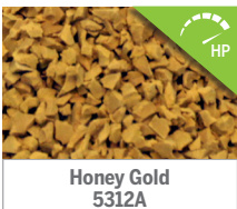
Honey Gold 5312A