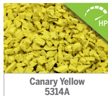
Canary Yellow 5314A