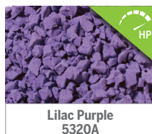
Lilac Purple 5320A