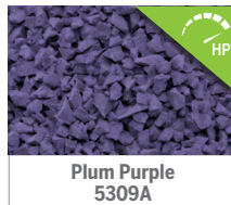
Plum Purple 5309A