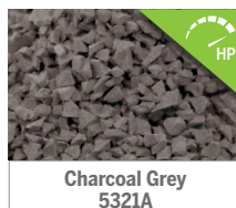
Charcoal Grey 5321A