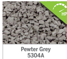
Pewter Grey 5304A