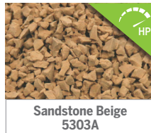
Sandstone Beige 5303A