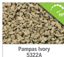
Pampas Ivory 5322A