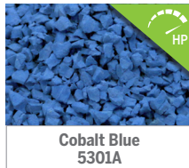
Cobalt Blue 5301A