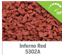
Inferno Red 5302A