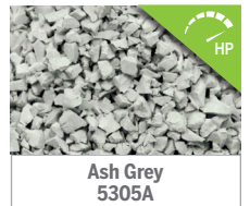
Ash Grey 5305A