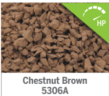
Chestnut Brown 5306A